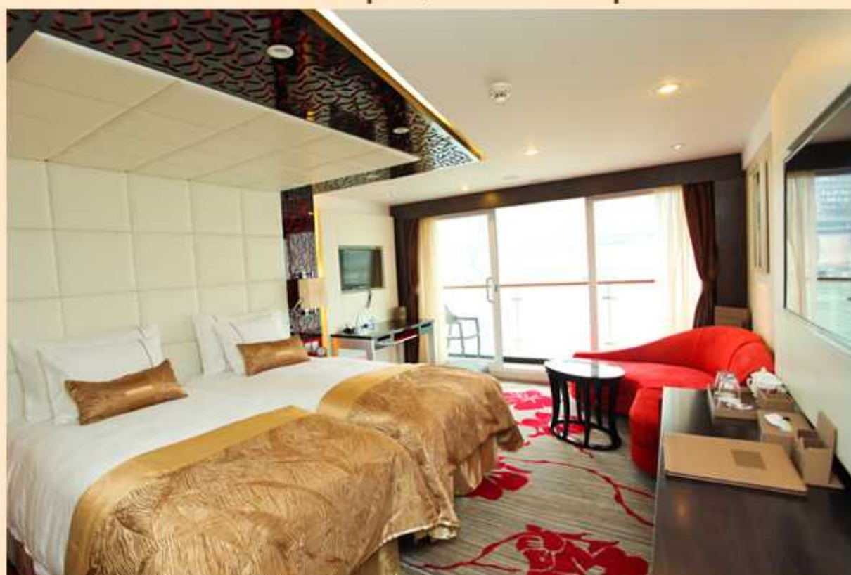
Executive Suite 38.50 sq.m/415.0 sq.ft