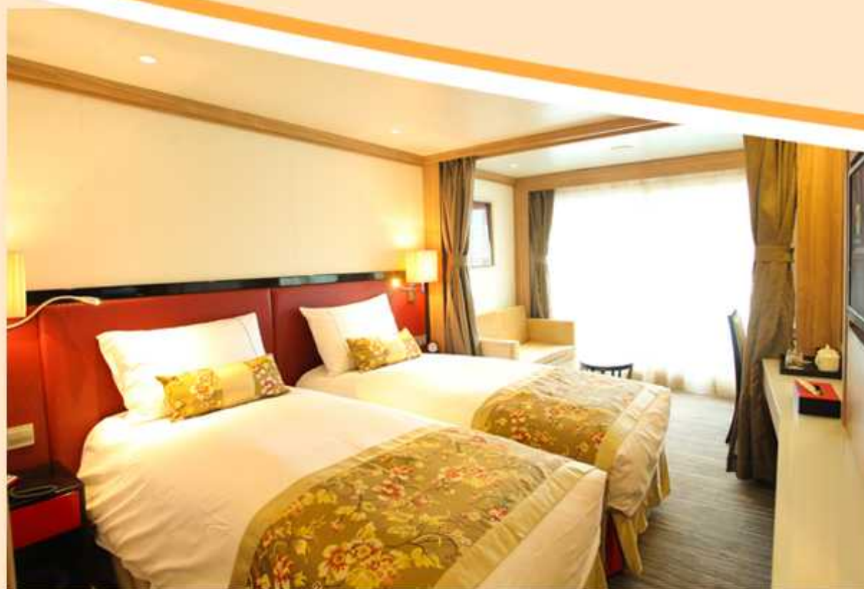
Deluxe Cabin 28.00 sq.m/301.0 sq.ft

Length: 141.8M Beam: 19.8M Height : 24.6 M Crew: 150 Capacity: 398 Decks: 7