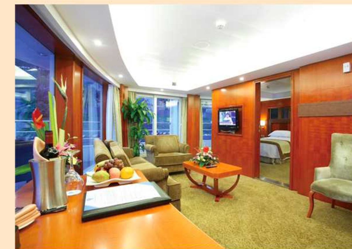
Presidential Suite 78.00 sq.m/839.6 sq.ft

The Century Diamond & Century Emerald have developed A La Carte restaurant, They are the first ships equipped with silencers and floor adaptations to decrease vibration and noise, with purified drinking water system in each river view state room. Guests also can enjoy fine cuisines in the A La Carte restaurant and Sundeck Barbecue Bar.