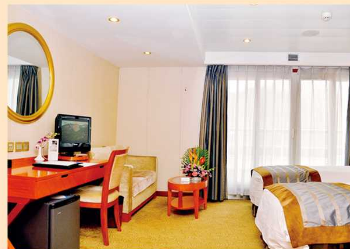
Junior Suite 28.00 sq.m/301.3 sq.ft