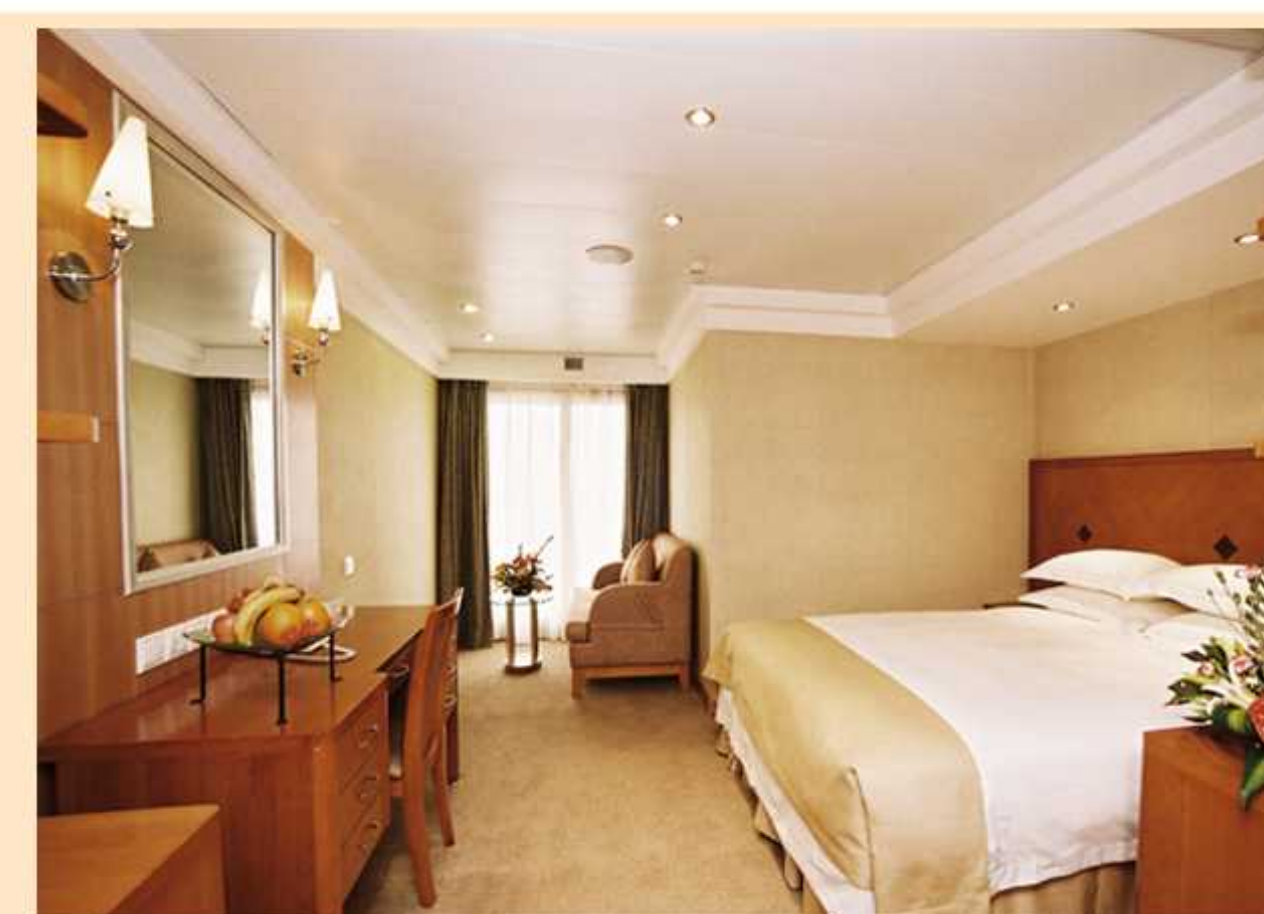
Junior Suite 30.00 sq.m/322.9 sq.ft