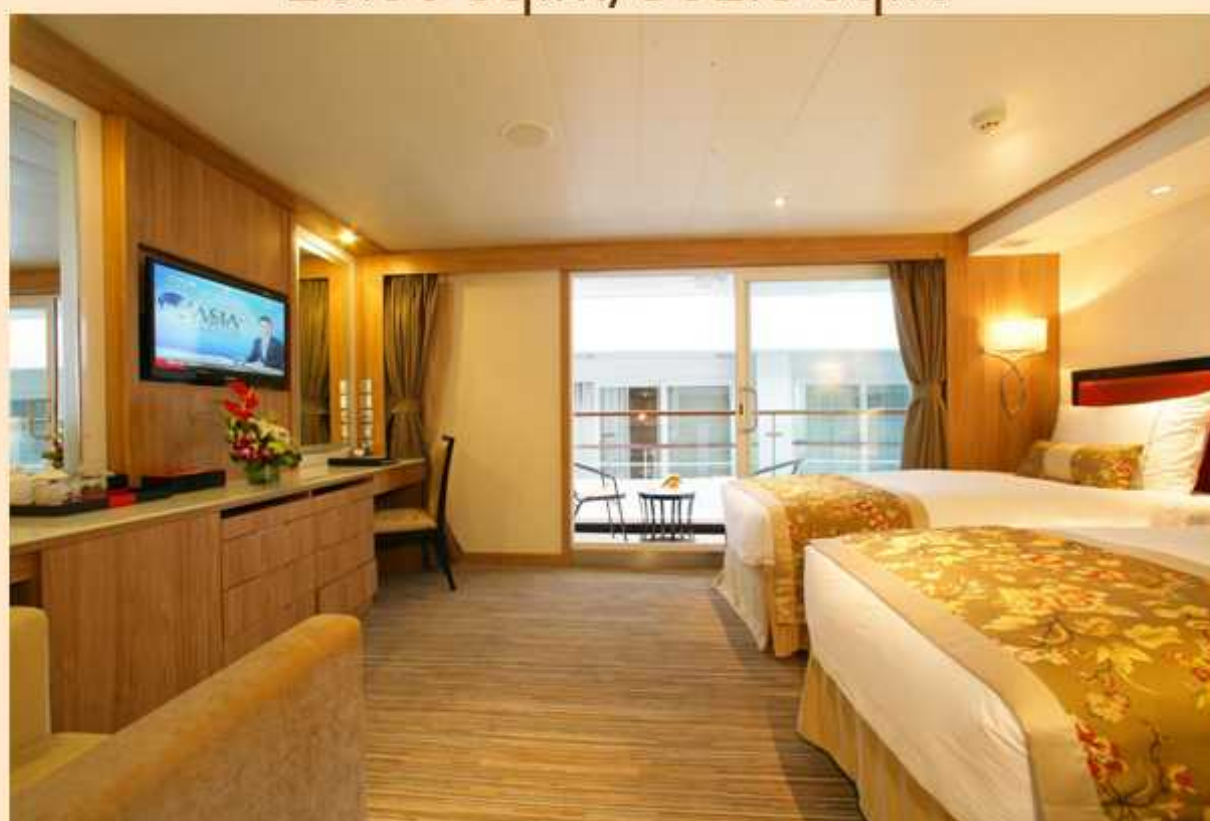
Junior Suite 30.00 sq.m/323.0 sq.ft