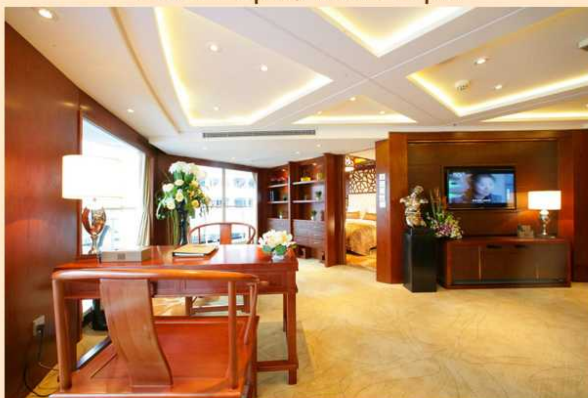
Presidential Suite 106.00 sq.m/1140.0 sq.ft