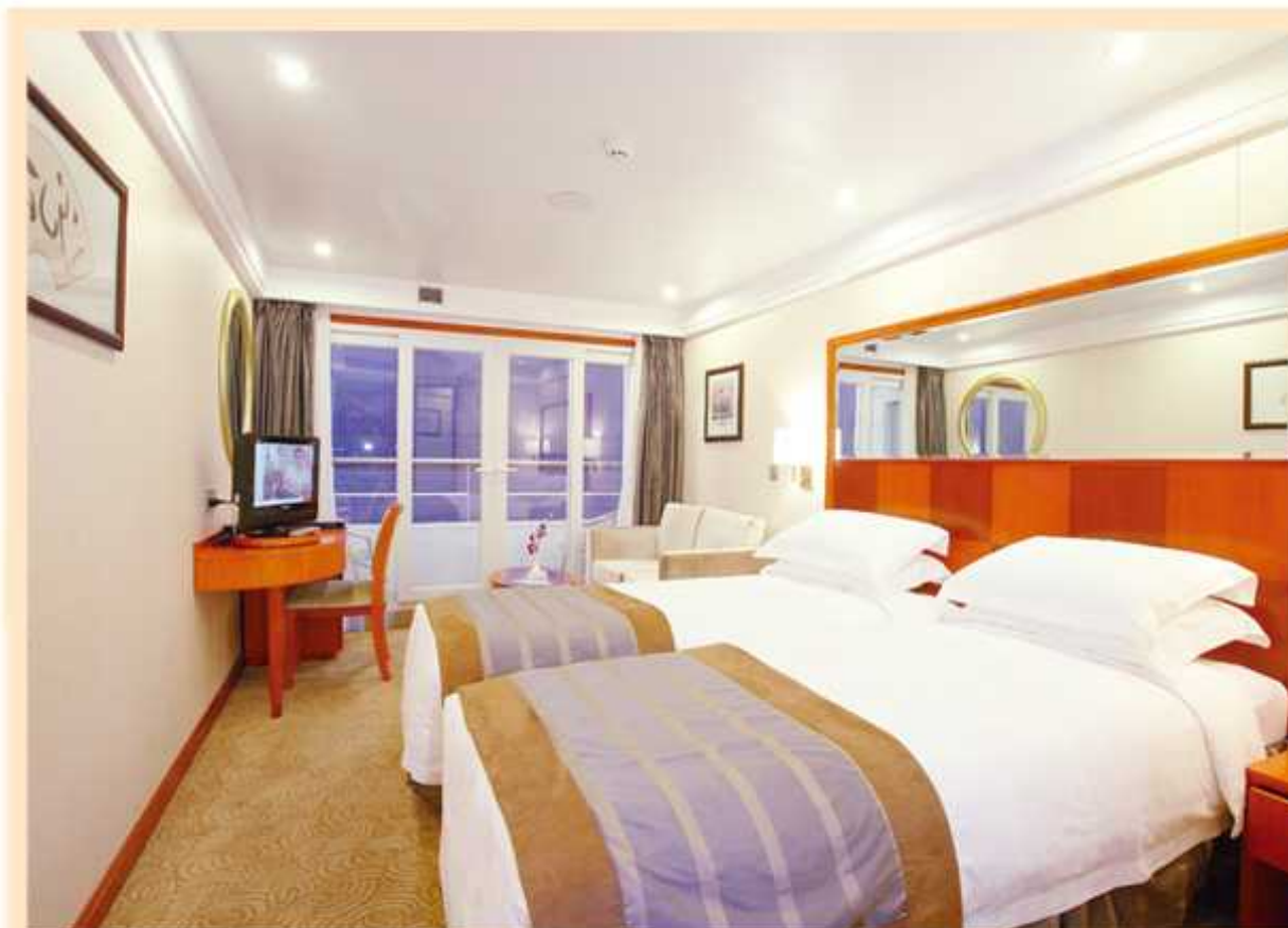
Deluxe Cabin 25.00 sq.m/269.1 sq.ft