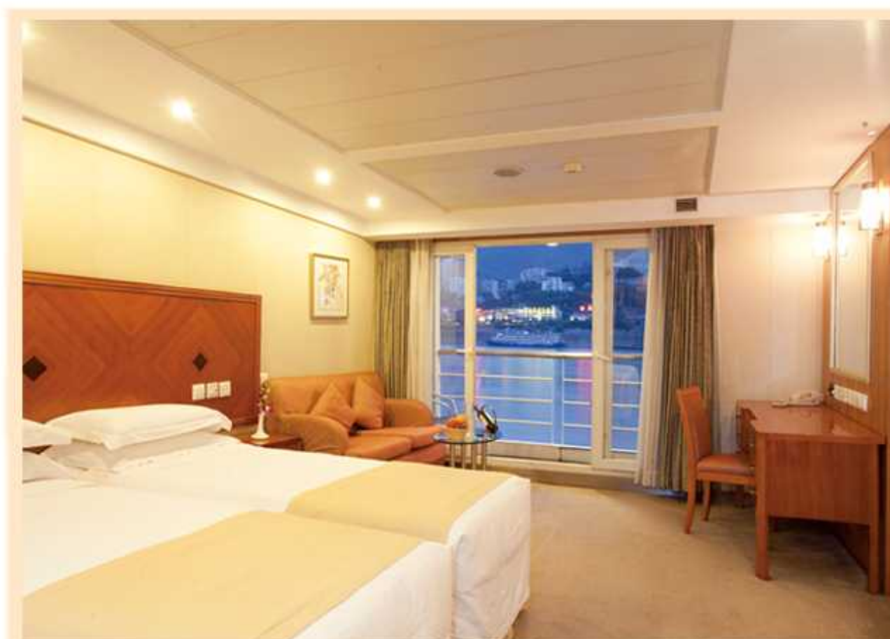
Deluxe Cabin 25.90 sq.m/278.8 sq.ft