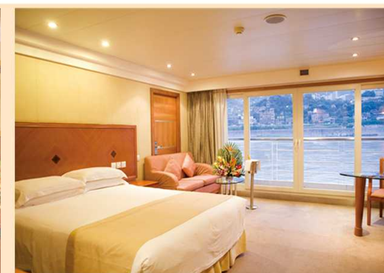
Deluxe Suite 35.60 sq.m/383.2 sq.ft