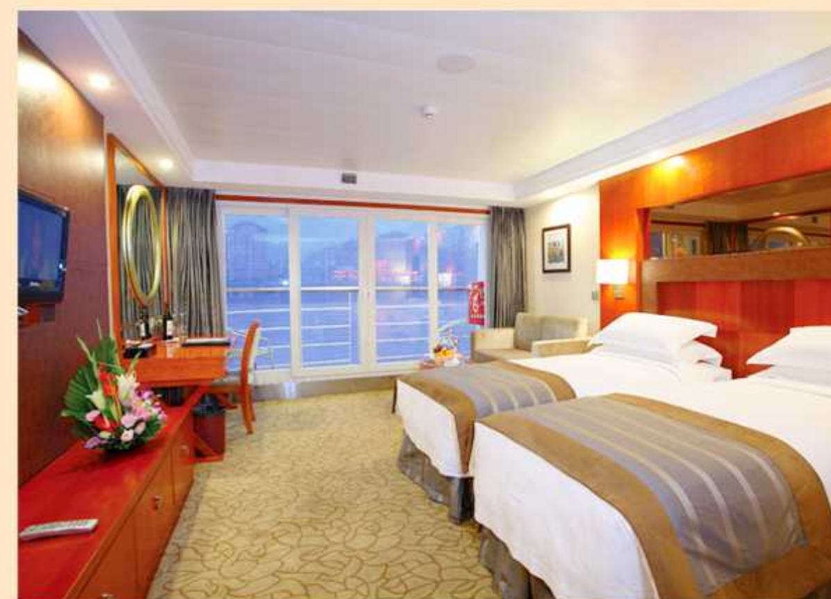
Deluxe Suite 30.40 sq.m/327.2 sq.ft